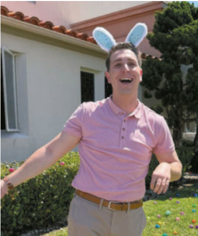
EASTER EGG HUNT 2025