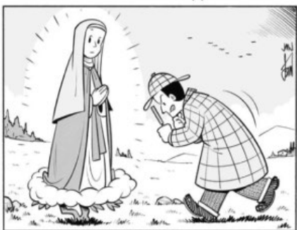
"The mysteries of the Rosary!"

"What do you get when your cross Sherlock Holmes and a Marian apparition?"