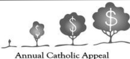
Annual Catholic Appeal

Prayerfully consider making a recurring weekly or monthly donation to our collection. Thank you for your investment and continued support of our parish!