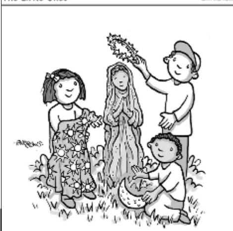
A great sign appeared in heaven: a woman clothed with the sun, and the moon under her feet, and on her head a crown of twelve stars. Rev. 12:1