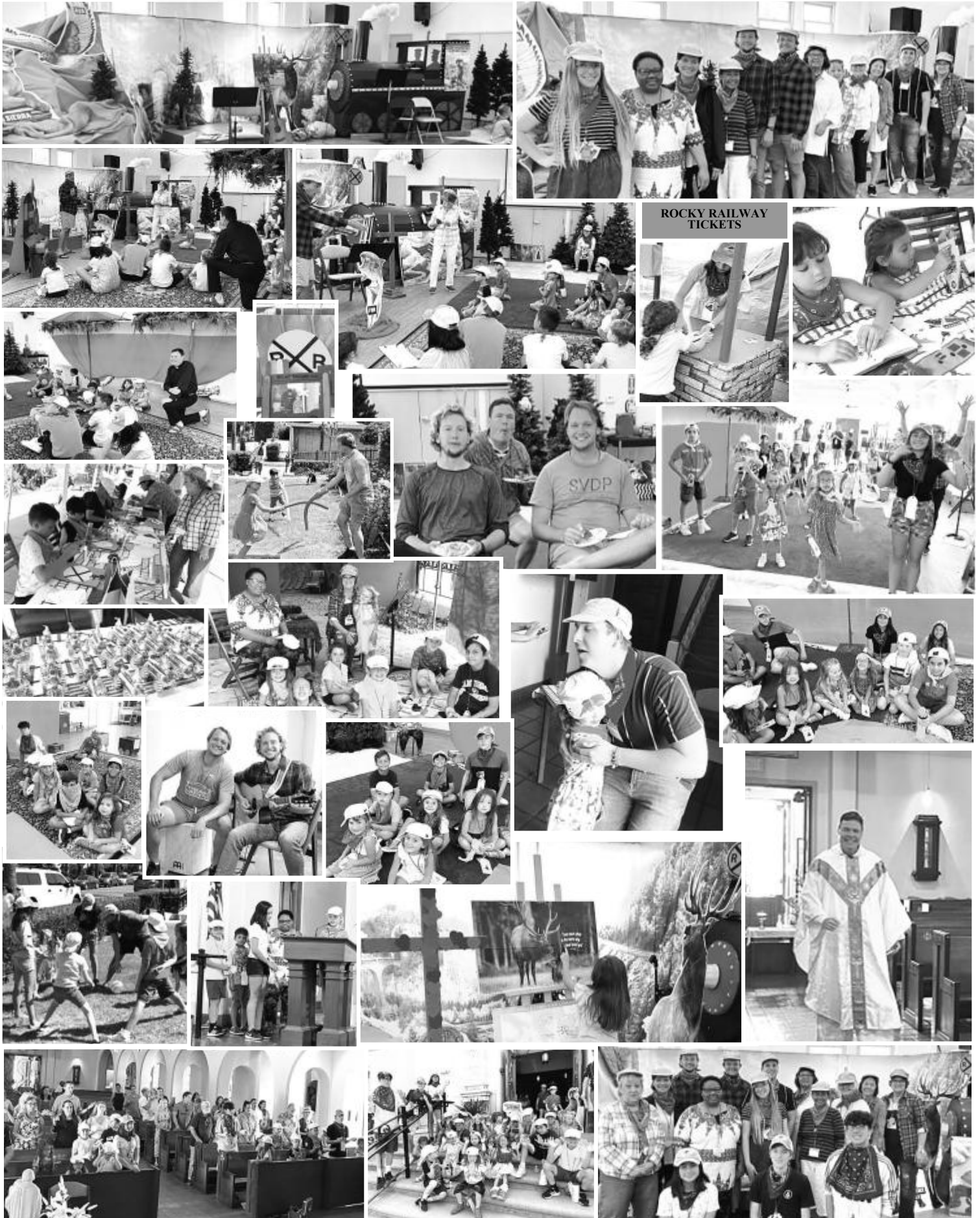
ROCKY RAILWAY TICKETS