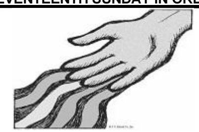
The eyes of all look hopefully to you,

and you give them their food in due season.